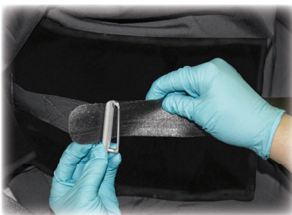
Push strap underneath middle part of buckle.

2 Weave strap through middle buckle as follows: