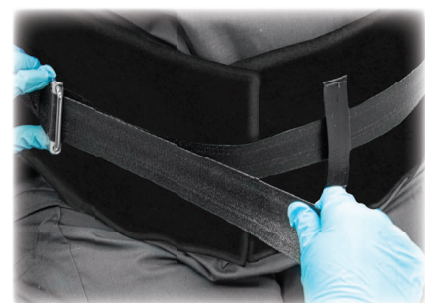
Tighten strap as tight as possible without causing discomfort.

Note: Check with nursing if new surgical wounds are located near belt