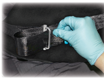
Pull strap back over the top of the middle part of buckle.