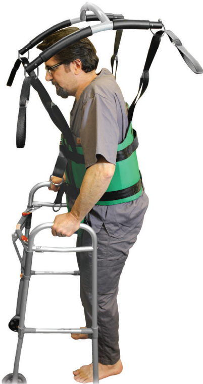
4pt Hanger Bar:

Attach each of the four straps to each one of the hooks on the hanger bar.