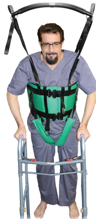
2pt Hanger Bar:

Attach the left side straps to the left side hook. Attach the right side straps to the right side hook.