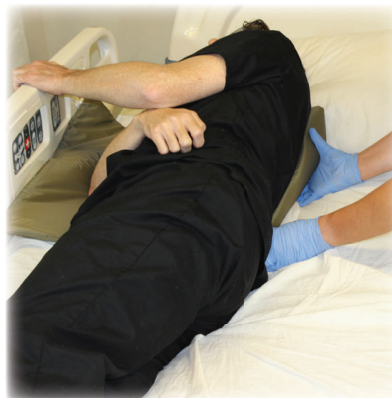
Roll patient to the other side