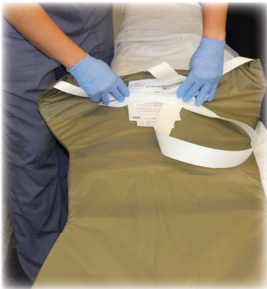
Lay TTurnerBSW on bed with label side up