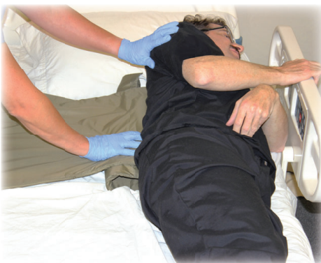
Roll patient to one side and place TTurnerBSW under patient's back with the roll (and label) facing down.