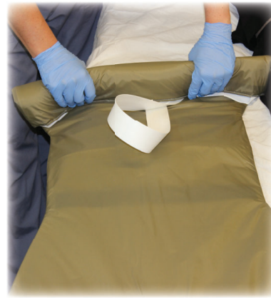
Roll up approximately one quarter of the way.