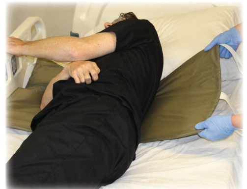
Unroll TTurnerBSW. Attach strap securely to bed frame on the side you will be turning patient towards.