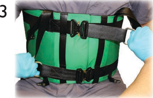
Hold both straps by the loops and pull outward to tighten. The vest should be tight without causing discomfort to the patient.