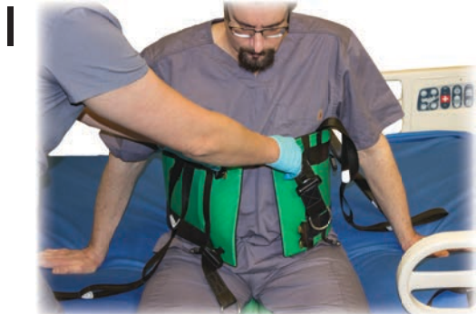
Place vest around patient's chest while in seated position.

Use only a single layer of clothing or gown- remove all other layers before placement.