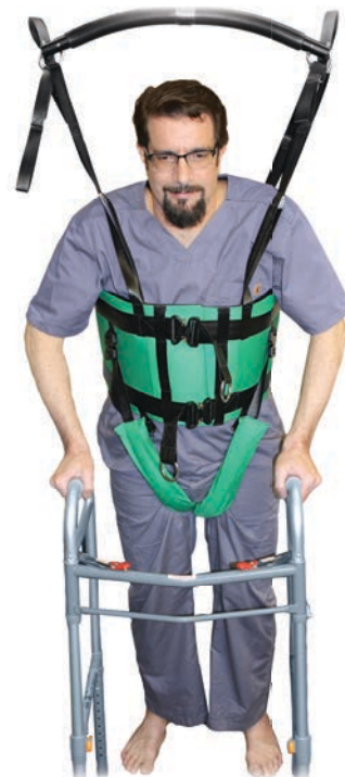
2pt Hanger Bar:

Attach the left side straps to the left side hook. Attach the right side straps to the right side hook.